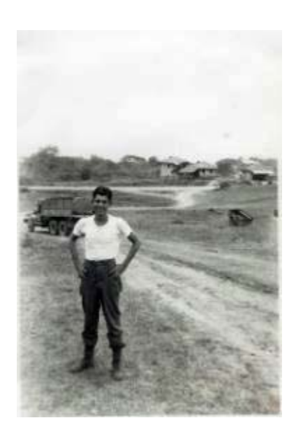
The Author in N. Luzon