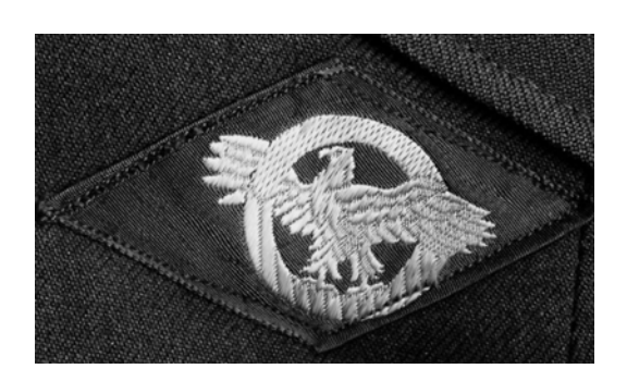
The Ruptured Duck

Respectfully submitted November 25, 2013 by Catherine Wilson, Secretary.