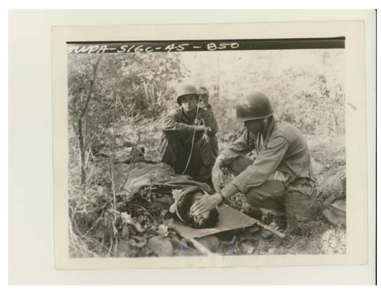
Medic Administering Plasma to Wounded Soldier - Northern Luzon