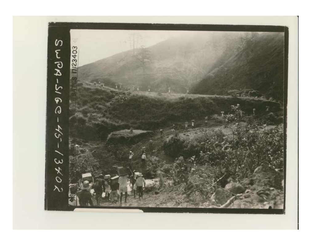
Filipino porters—Balete Pass--Northern Luzon-- 1945