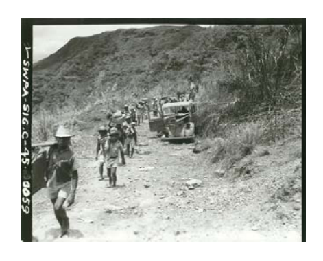
Filipino Porters N. Luzon

Shortly before June 10, we moved again. Our regiment was headed north along Highway No. 5, through the Balete Pass, and into the Cagayan Valley. Our trek was long and damp, under threatening skies, through cloud-shrouded mountains. The narrow twisting rough mountain road ran high on the sides of thickly-forested A fine, but very wet mist continuously enveloped us, and at times we passed through thick soggy grey clouds which limited our vision to only a few feet.